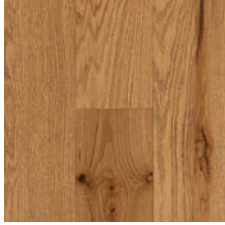
Harvest 6-1/2" BRRT63EK14WEE