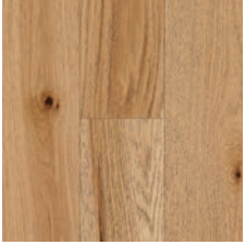
Natural 6-1/2" BRRT63EK04WEE