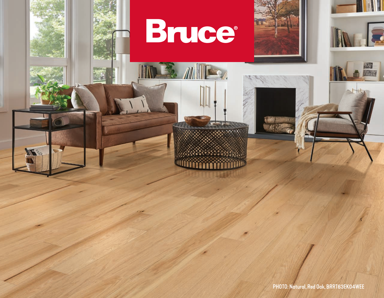
PHOTO: Natural, Red Oak, BRRT63EK04WEE