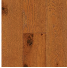
Gunstock 6-1/2" BRRT63EK24WEE