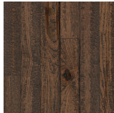
Jefferson 3-1/4" BRBL35EH54X