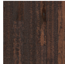
Farmhouse 3-1/4" BRBL35EH34X