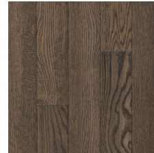
Mineral 4" BRBL45EK27X