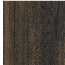
Split Rail 4" BRBL45EK37X