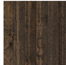
Wyoming 3-1/4" BRBL35EH44X