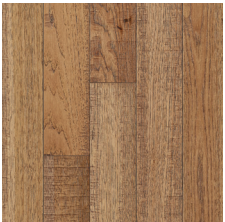
Hay Loft 4" BRBL45EH07X