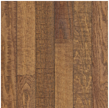
Monroe 3-1/4" BRBL35EK14X