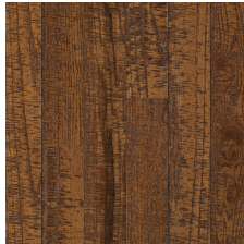
Lincoln 3-1/4" BRBL35EK24X