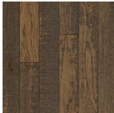
Homestead 3-1/4" BRBL35EH04X