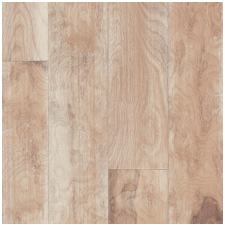
Ethereal 6-1/2" EBBF72L01WEE