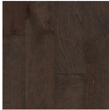
Elemental Slate 6-1/2" EBBF72L03WEE