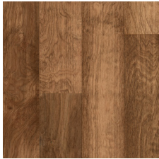
Embers 6-1/2" EBBF72L02WEE