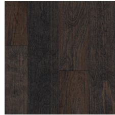
Darkened Latte 6-1/2" EBBF72L04WEE